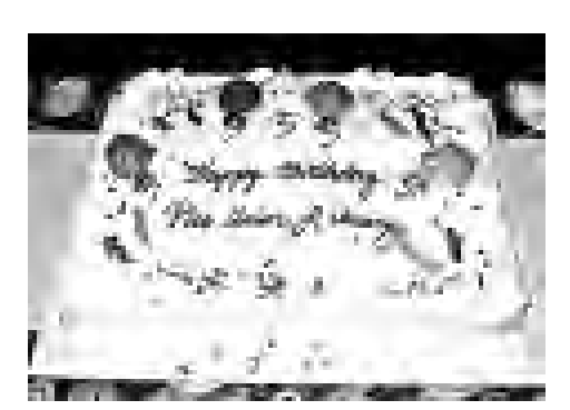
The anniversary cake.

The event featured music and dancing with Fiesta Flamenco Dancers and was open to the public. Many children from the community participated in the activities.