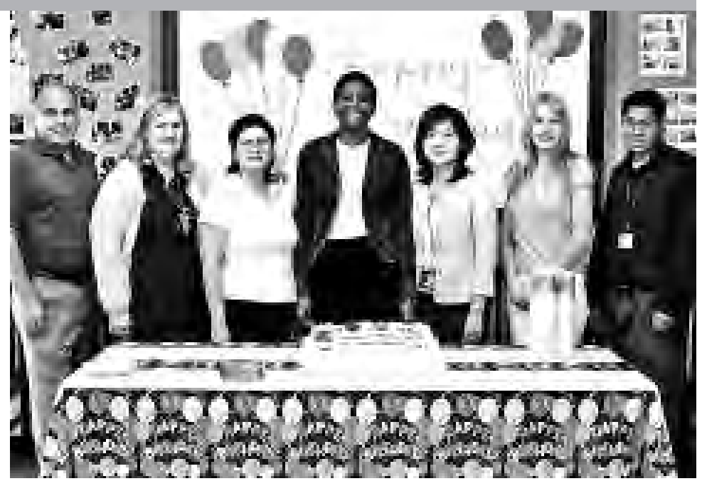
The Pico Union Library staff.