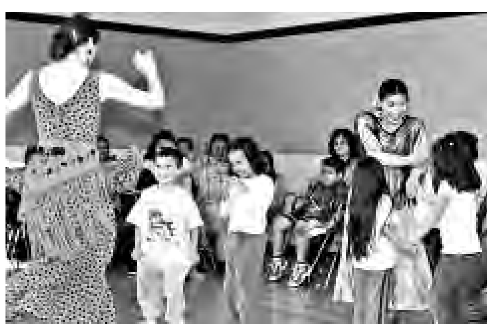
Flamenco dancers dance with children.