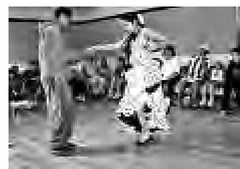
A flamenco dancer dances with a library patron.