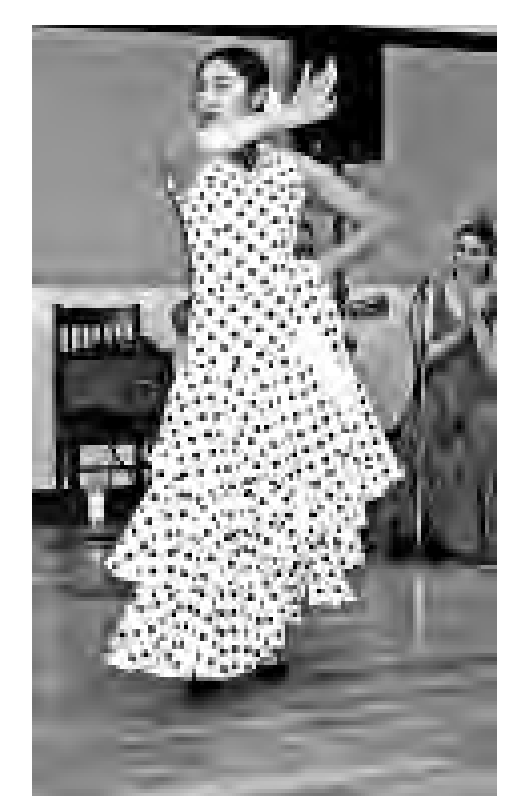
A flamenco dancer.