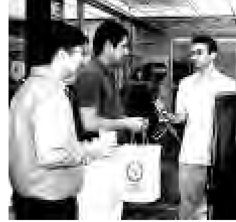
Employees get information from schools.