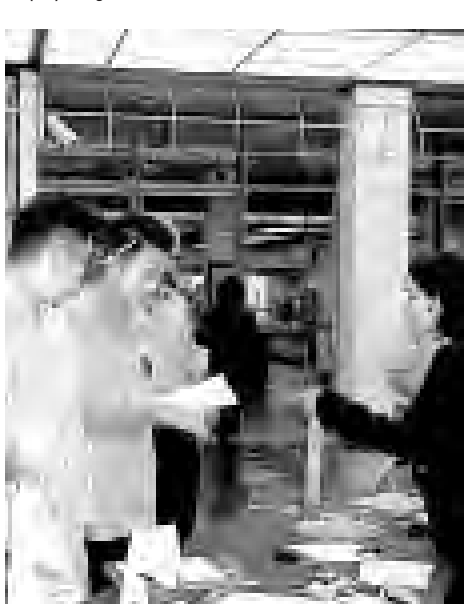
Employees get information from schools.