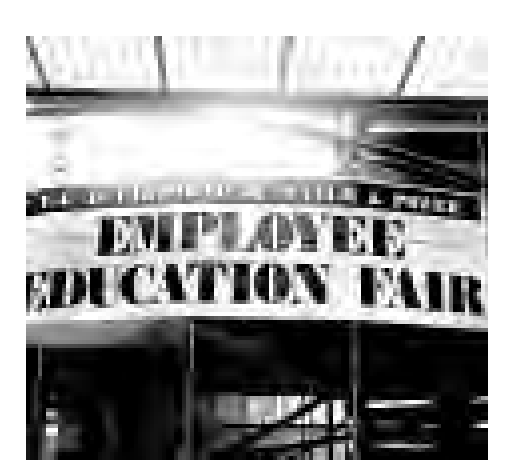
A banner announcing the event