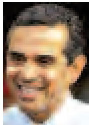
Antonio Villaraigosa, Mayor

Antonio Villaraigosa was sworn in on the south steps of City Hall Friday, July 1. Joining him and his family on the platform were national and civic leaders, including former Vice President Al