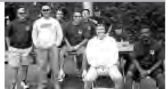
This group of volunteers, consisting of Police Officers, helped set up and clean up the event.