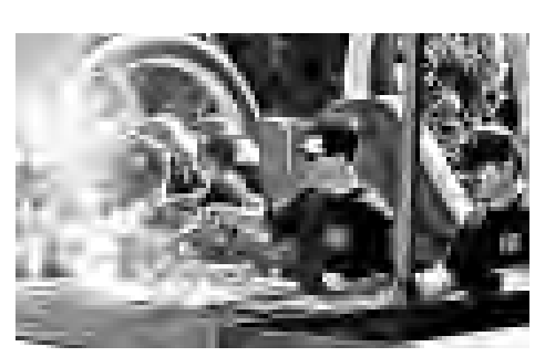
City employees working their magic on the grill.