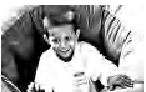
The smiles were priceless.