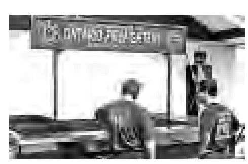
Ontario firefighters provided a huge red barbeque grill to cook the delicious hot dogs and hamburgers.