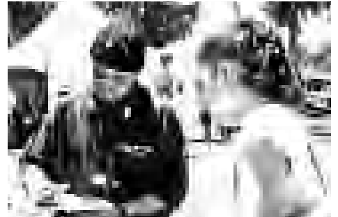
Boxer Michael Carbajal signs autographs.