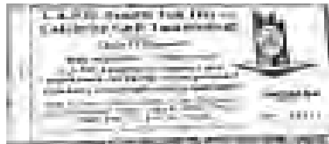
An event ticket.