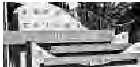
Welcome to the event.