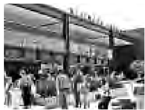
The Westwood Branch of the Los Angeles Public Library.