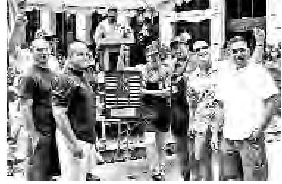
Judges choose Station 10 as the winner of the food competition.

Congratulations to everyone for a successful