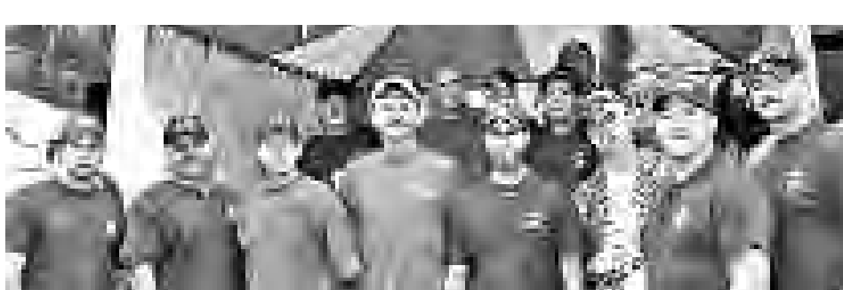
Station 15: carne asada.