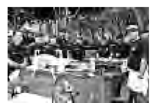
Barbecuing at Station 9.

When you want to repaint, make sure to use your Club discount at Dunn-Edwards paint stores.