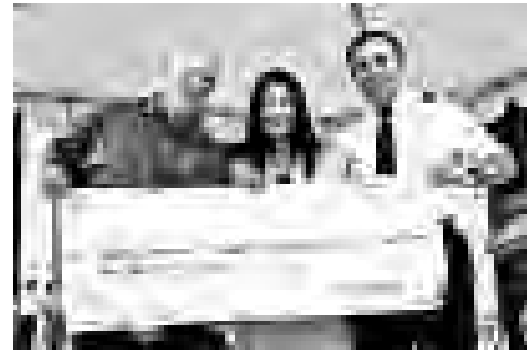
Maguire donates $5,000.