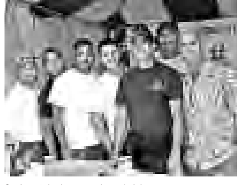
Station 10: barbecue pork sandwiches.