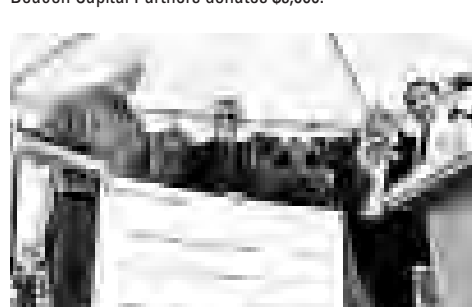
Bank of the West donates $3,000