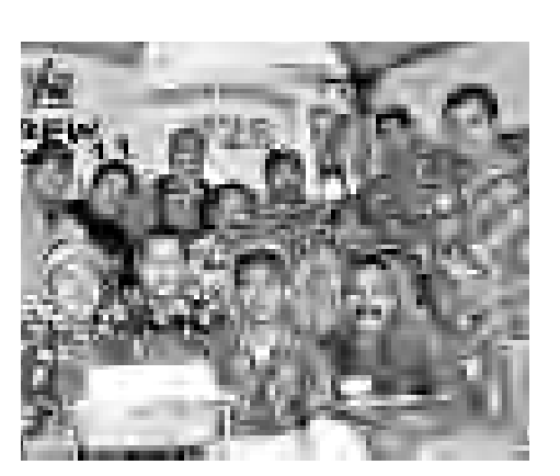
Station 26: Hawaiian short ribs.