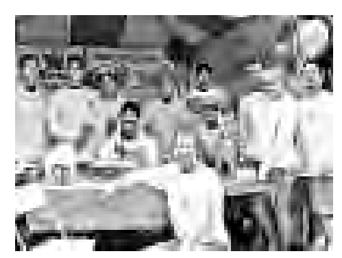
Fire Station 3: tamales.