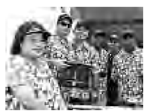
Headquarters Planning: barbecue ribs.