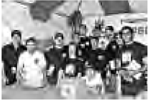
Station 66: carne asada.