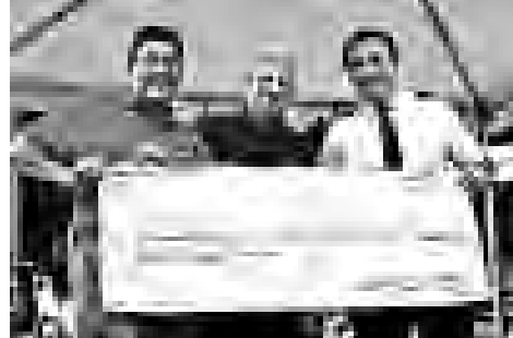
Beacon Capital Partners donates $5,000.