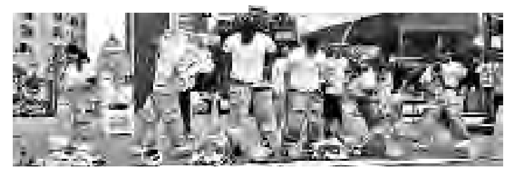
Club participants dress as fast as they can in the fire suit-up competition.