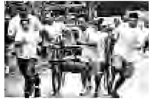
The Club Team runs to a fire hydrant.