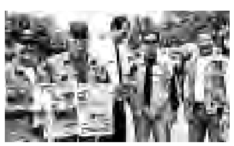
Fire Hogs reading a copy of Alive!