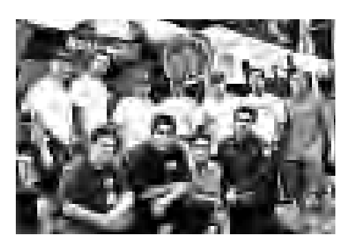
Station 27: chicken burritos.