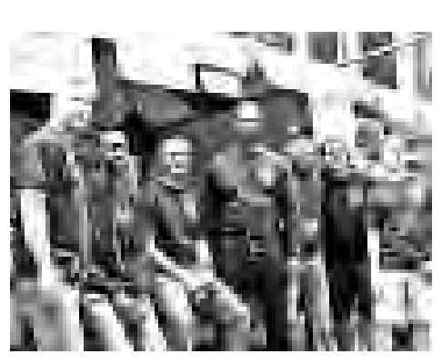
98 Task Force: firehouse sundaes.