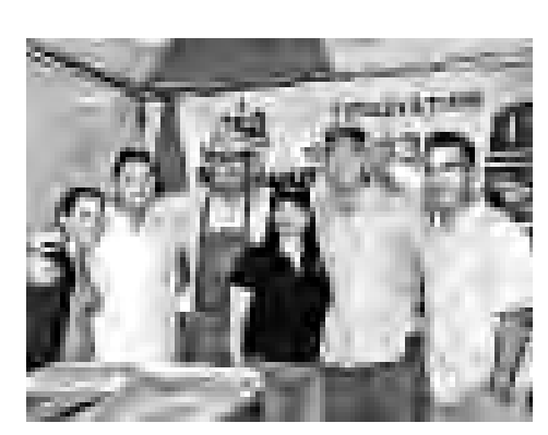
Station 39: chicken tostadas.