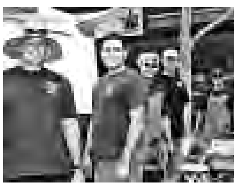
Fire Station 29: Korean barbecue