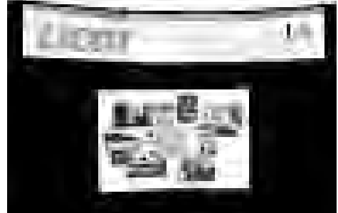
A poster displayed on one of the DOT floors.