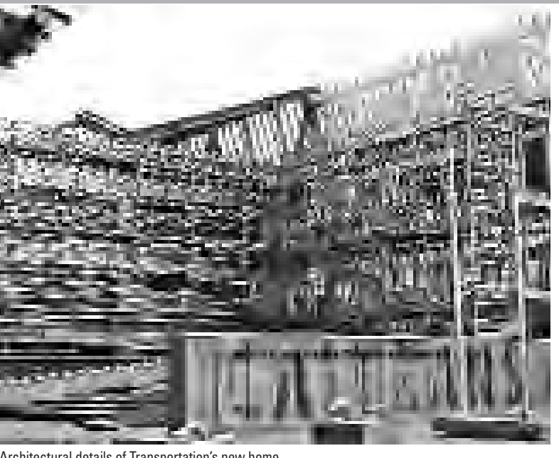
Architectural details of Transportation's new home