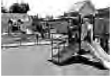
Tiny Dots Day Care Center.