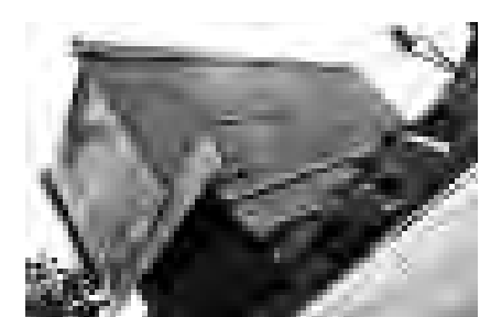
Architectural details of Transportation's new home.