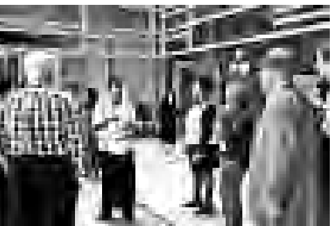
A Caltrans employee and Transportation employees begin the tour.