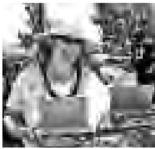
"Games Guru," 7 years, Management Analyst II.