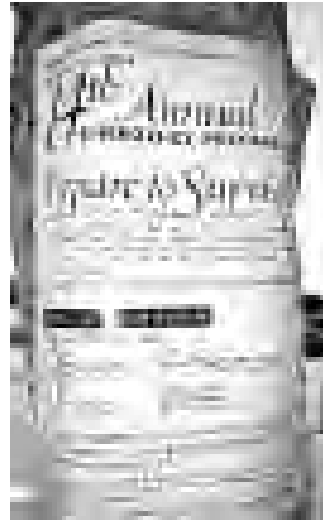
An Emergency Preparedness sign.

Congratulations to all for an excellent and important event.