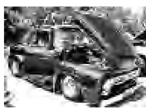
A 1956 Ford F-150.