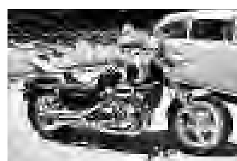
A Honda Magna motorcycle.