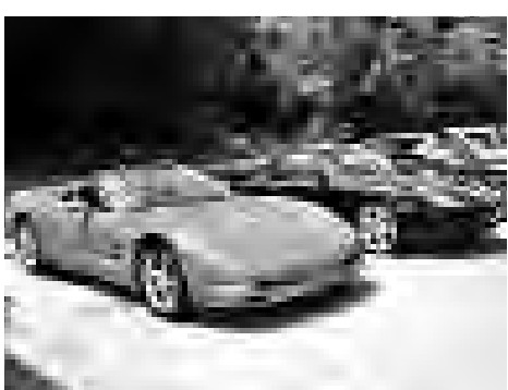
A Corvette and a Porsche Boxter.