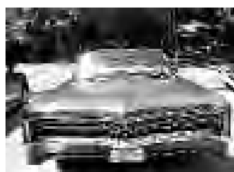
A 1965 Chrysler.