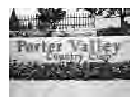
A Porter Valley sign.