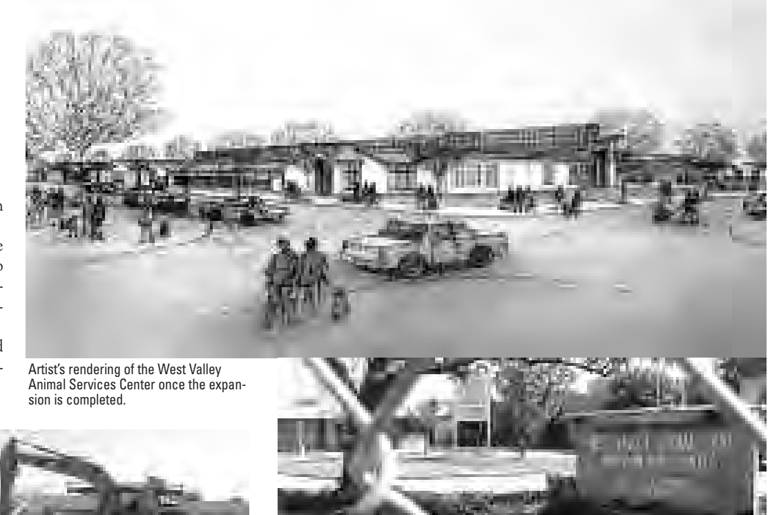
Construction is starting for the new center.

The Department of Public Works is responsible for construction, renovation and operation of public facilities and infrastructure ranging from curbside collection and graffiti removal to maintenance of sidewalks, bridges, sewers and streetlights, and from maintenance of wastewater treatment plants to design of public buildings.