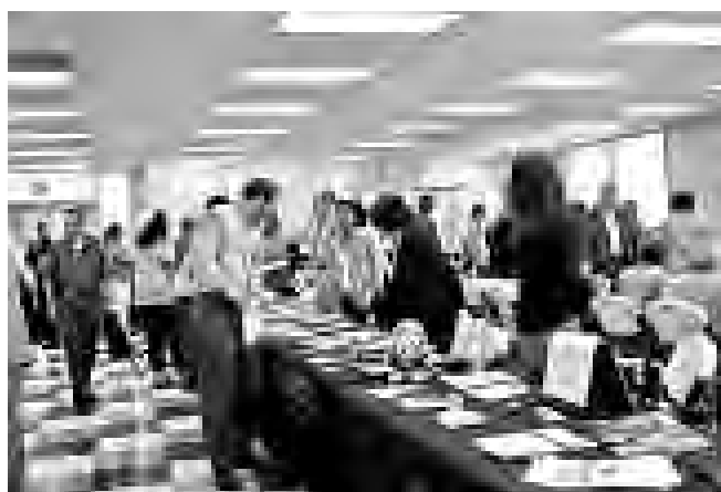
LAX employees visit the different booths.