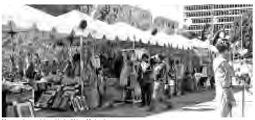
Many vendors participated in the African Marketplace.

The LAABP is the official representative for City of Los Angeles employees of African American heritage. Incorporated in 1972, the LAABP advocates equal employment within the City's workforce and increased opportunities for "people of color" to attain management and executive positions. Among the services the organization provides are career development seminars, student scholarship program, mock interview programs and networking forums.