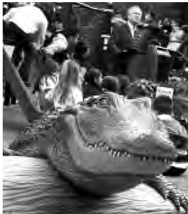
One of the specially commissioned animal sculptures that have been designed to appear as though they are emerging from the water (there's also a hippopotamus).