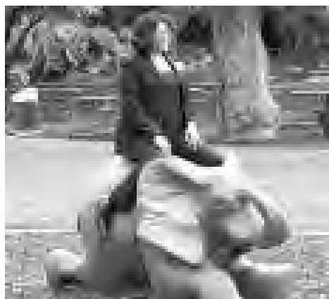
Even the grownups were having fun!