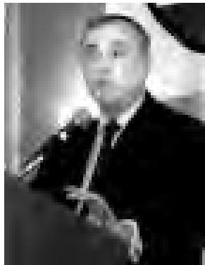
Chief of Police William J. Bratton congratulates the award recipients.