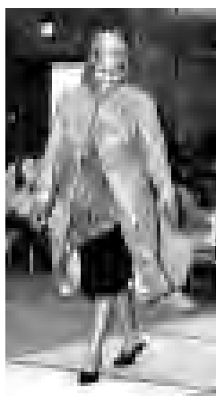
Shelly Wilks, Maintenance Laborer, 5 years, participates in the fashion show.