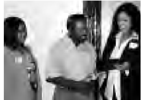
Local 18 presents a certificate.