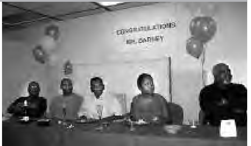
The guest of honor table.