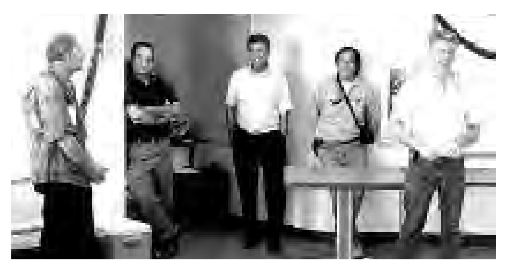
DWP meter testers holding forth at the party with exciting stories of derring-do.