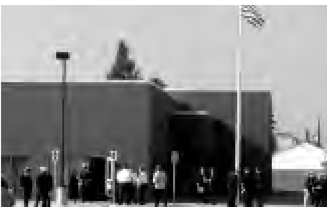
The LAFD's new training classroom facility is ready for action.

With the modernization of this facility, the community around the fire station will benefit greatly by having firefighters who are highly trained and capable of many fire and rescue skills that will save many of their lives.