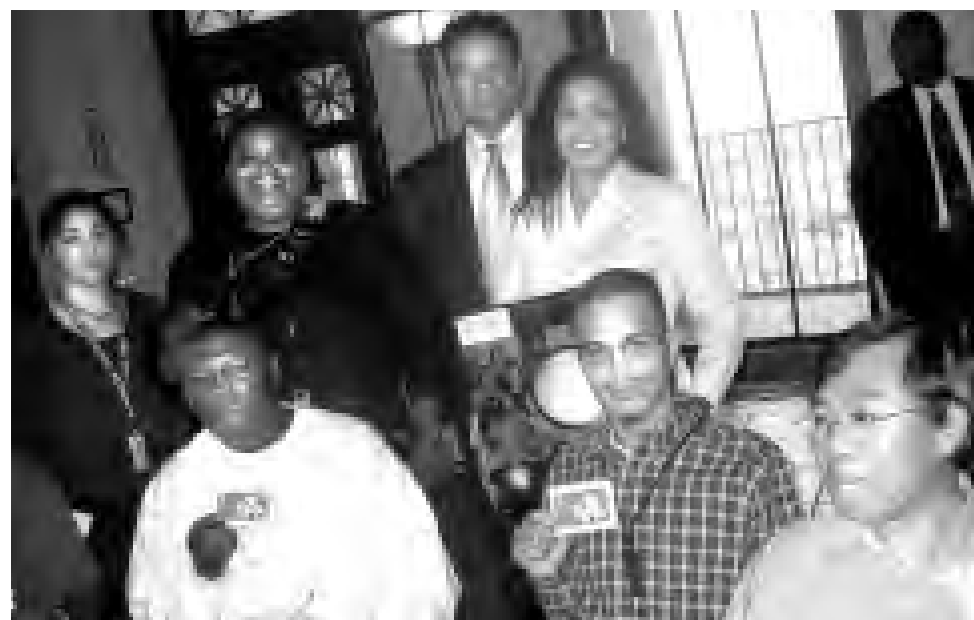
Some of the prize winners display their winnings at the recent Mail Services Appreciation Day.