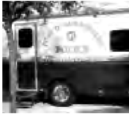
Port Police Mobile Operations Center.