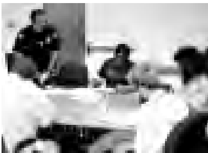
The crowd completing the questionnaire.