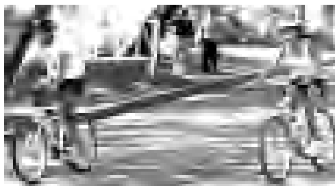
Seven miles of mountain bike riding.