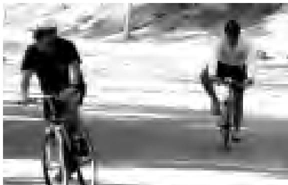
Seven miles of mountain bike riding.