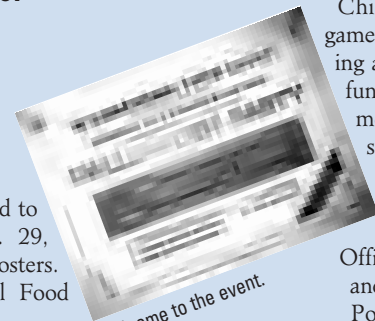
Welcome to the event.