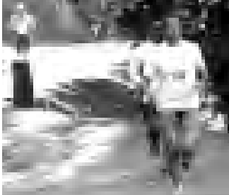
The two-mile trail run.