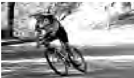
Seven miles of mountain bike riding.