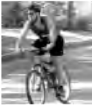
Seven miles of mountain bike riding.