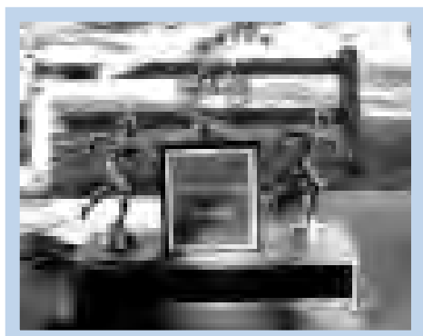
The Team Champion Trophy.