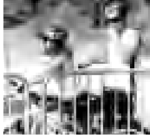
Going for the seven-mile mountain bike ride.