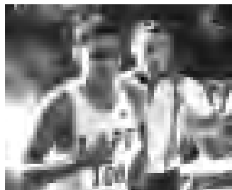
A sprint to the finish line!