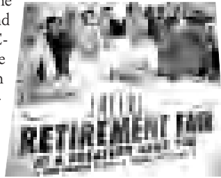
Welcome to the LACERS Health Fair.