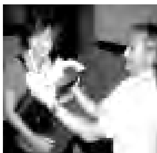
Milla Castaneda, Retired, Controllers Office, happily smiles for her five minute courtesy massage, thanks to Blue Cross.