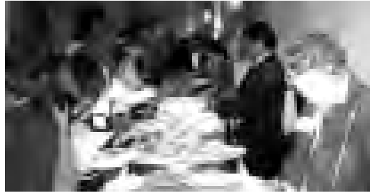
The buffet lunch line.