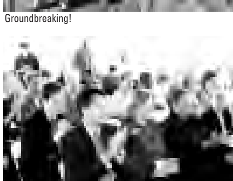
Guests applaud the speakers.