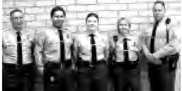
Animal Shelter employees pose for a picture at the groundbreaking ceremony.