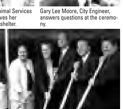
City representatives break the ground for the new Animal Shelter.