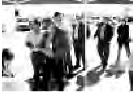
Guests wait to purchase their tickets to the feast.