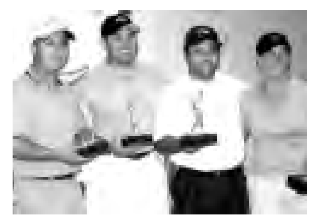
Second place team trophy winner.