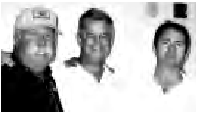
Diamond Sponsor: Capital Group