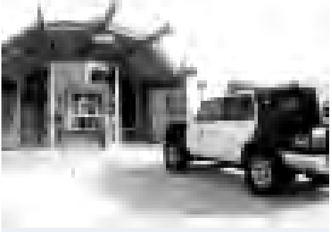
The LAPD Substation at Venice Beach.