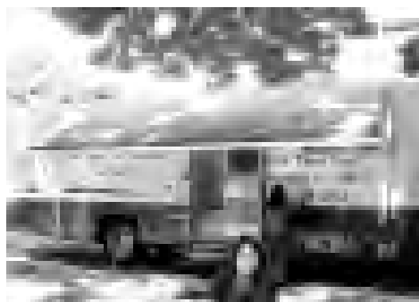
The Elizabeth Center for Cancer Detection's mobile unit.