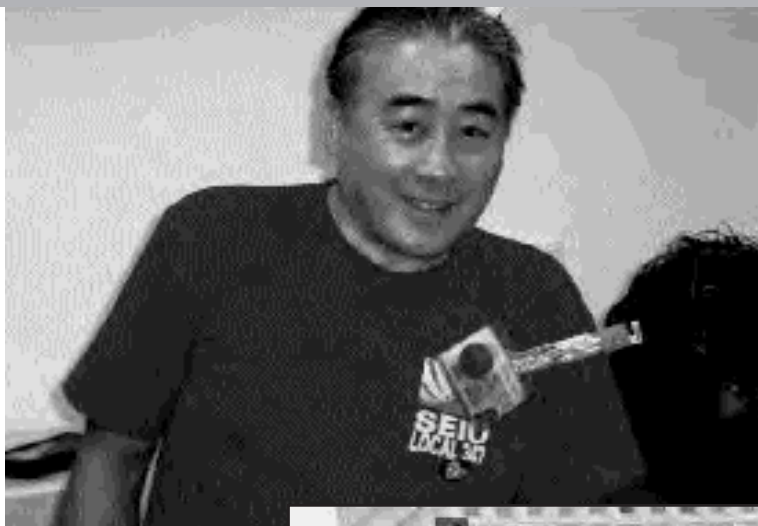
A union member getting ready for a City Hall East sleep-in (notice the toothbrush) June 25 during contract negotiations.

To help the City deliver services as intelli-