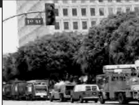
Driving around City Hall looking for a contract.

gently and efficiently as possible, the union developed a list of cost-saving proposals to save City funds and resources. That list was presented at the bargaining table, following the release last year and this spring of the more lengthy Volumes I and II of workers' ideas to save money and generate revenue.