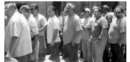
Attendees at the event stand in line for the barbecue.