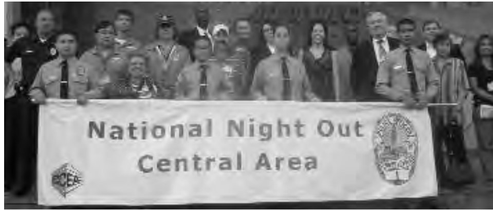
Participants assemble in front of Central PD for group picture before the walk.