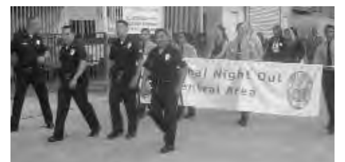
Entering the Old Bank District.