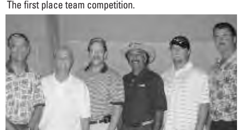
The Port of Long Beach Team.