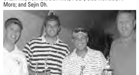
The first place team competition.