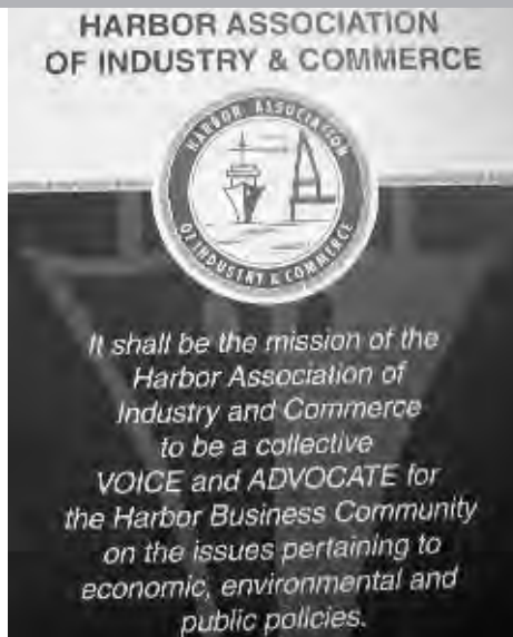
The golf tournament sign.

The Club sponsored Hole 17. Closest to the pin won a $100 gift certificate to Golfsmith.