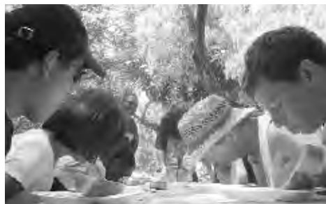
The watermelon-eating contest. First place trophy was awarded to Cynthia Banks.