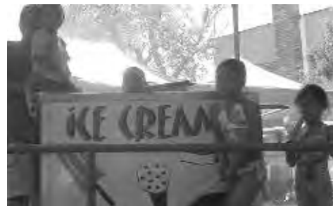
The ice cream cart was a big hit with the young and old.