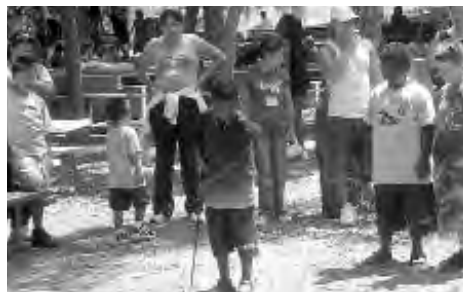
The putting green contest was popular with all ages.