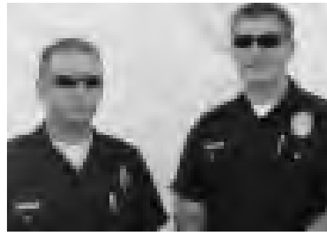
LA's Finest taking care of Lotus Festival.