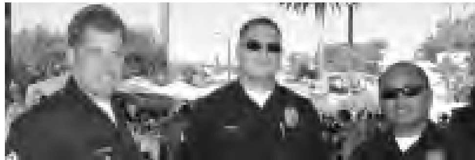
LA's Finest taking care of the Lotus Festival.