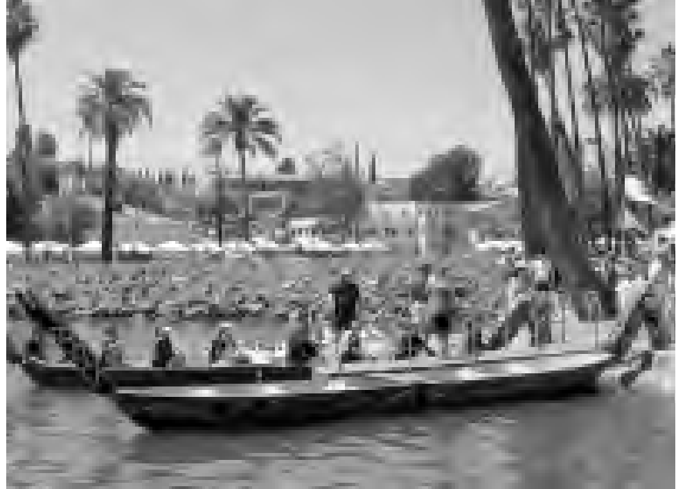
A boat at the Lotus Festival.

Artisans-at-work were on hand to demonstrate their skills on the beautifully decorated