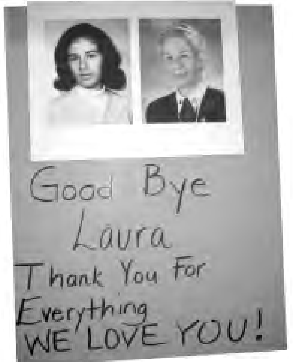
The welcome sign.