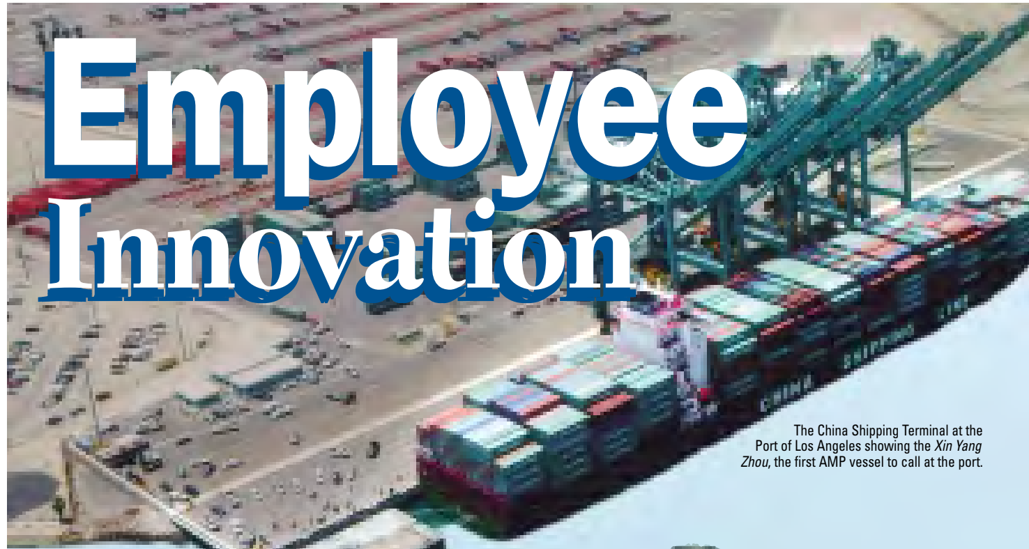
The China Shipping Terminal at the Port of Los Angeles showing the Xin Yang Zhou , the first AMP vessel to call at the port.