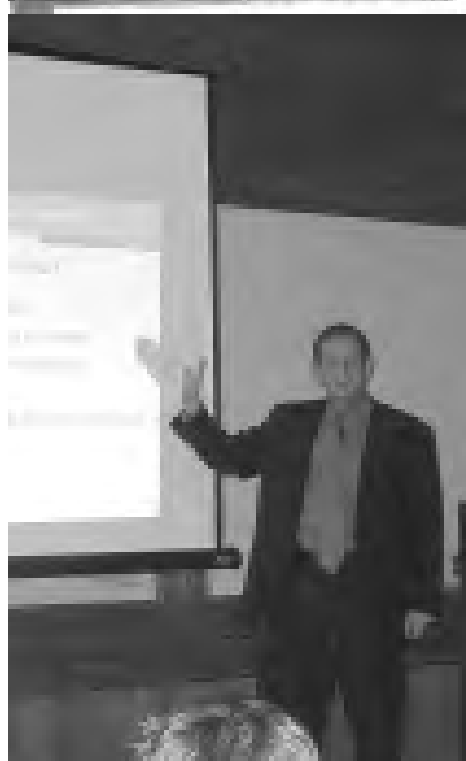
The first Club-sponsored Financial Planning Seminar, held May 24 at the Proud Bird Restaurant in Westchester.

solid asset allocation and a solid rate of return. The best way to go about it is, set a longterm goal, and then work with a financial adviser to get there step by step. That's what we do."