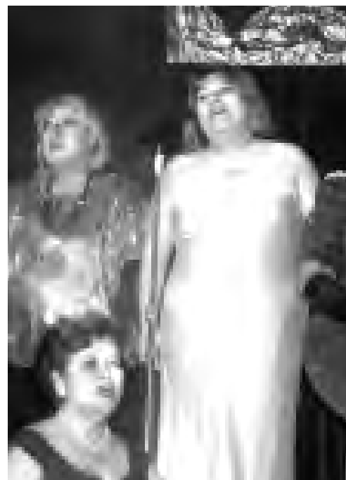
The Choraliers present "Let's Go to the Movies."