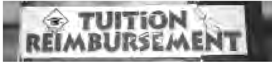
A banner at the College Fair reminds guests of the tuition reimbursement plan.