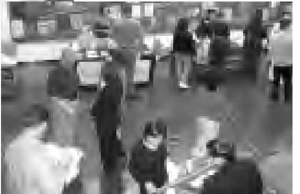
At the College Fair.