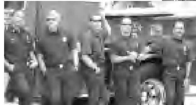
Firefighters of Fire Station 27 awaiting arrival of the Olympic Torch.