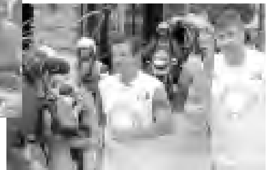
Sports television personality Fred Roggin bringing in the Olympic torch after a one-mile run.