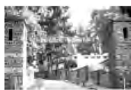
The Charity Ride started here at the Police Academy.