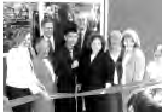
The ribbon cutting.