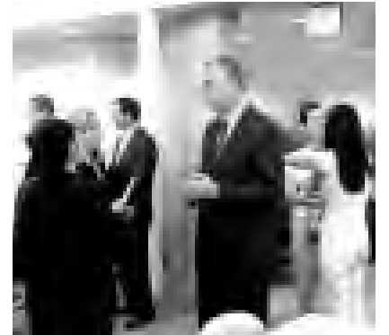
Mayor James Hahn inspects the interior of the new library.