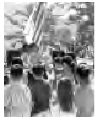
The Explorers Color Guard of the LAPD Pacific Area lead the Pledge of Allegiance.