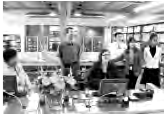
The library staff is ready for first-day visitors.