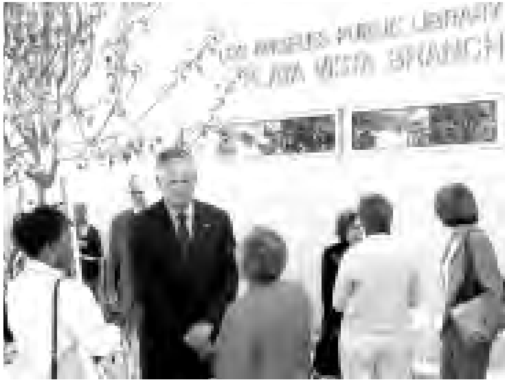
Mayor James Hahn greets guests at the event.