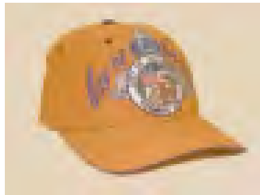
City hat with "City of Los Angeles" script

Wear the City proudly with these embroidered ball caps!