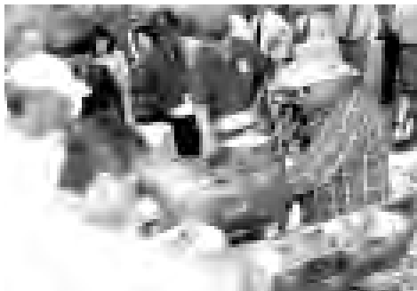
The lunch buffet.