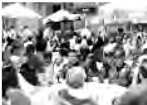
The Harbor Department's perfect attendance event.