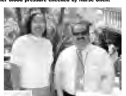
Tax Compliance Officer II.