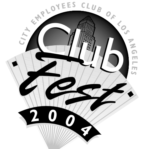
Last year's ClubFest was a great success. Set the date for this year's picnic: Sunday, Oct. 3.