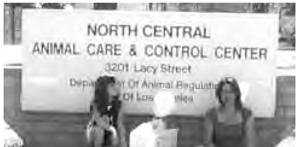
The Adoptathon event at Animal Services' North Central Shelter.

The Club congratulates Animal Services on its successful event for a very good cause.