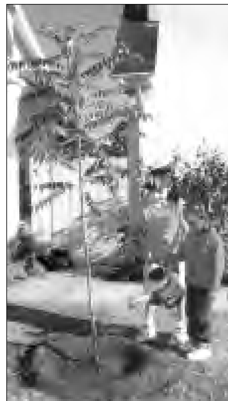
The DWP' Trees for a Green L.A. program is the perfect project to bring your family together to keep L.A. beautiful.

Residents are responsible for planting the trees they receive, which they can do individually, through a gardener, or as part of a community tree-planting day organized in their neighborhood. Residents are also responsible for on-going maintenance and care of these trees, including watering.