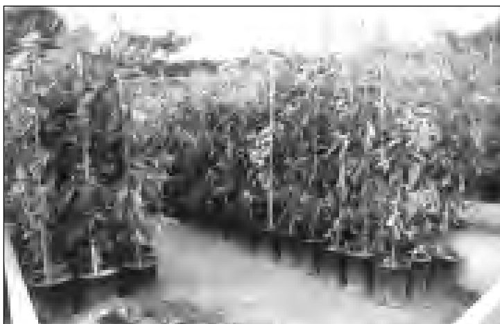
The DWP grows a number of trees to keep Los Angeles shady and beautiful.

Urban Forestry Project of the Year, and the California Municipal Utilities Association (CMUA) awarded it the 2004 Community Service/Resource Efficiency Award for Best Use of Public Benefit Funds. 🌳