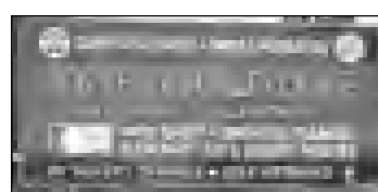
The Club was well represented at the golf tournament.