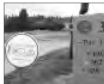
The Club was well represented here at hole 3.