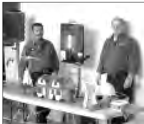
Last year's Fair at Baldwin Hills Crenshaw Plaza.