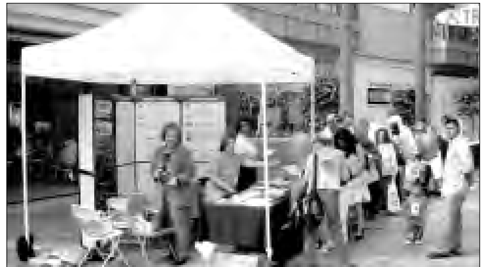
Last year's Fair at the Westside Pavilion.