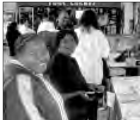
Last year's Fair at Baldwin Hills Crenshaw Plaza.